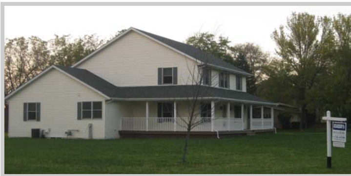
Figure 6.9 indicates the County had 2,215 home sales in 2006, a ratio of 1 home sale for every 72 people in the County. Figure 6.9 indicates the County’s Home Sales : Population ratio (1 : 72) was in the lower range (more sales per person) in comparison to neighboring counties in 2006.

Source: Wisconsin Realtors Association - 2008 Rock County Planning, Economic & Community Development Agency - 2008