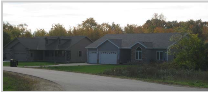
Figure 6.12: Affordability: Rock County: 1990 - 2006

Figure 6.12 displays monthly owner costs and rent (gross) as a percent of household income in the County from 1990 to 2006.